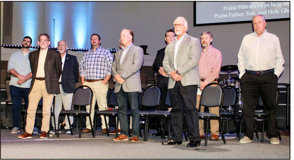
As they do every year, local pastors and community leaders led the National Day of Prayer event inside First Baptist Church last week.