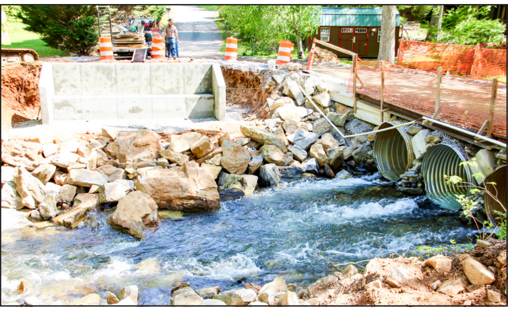
All construction to prep the Fisher Field site has been completed, so work can begin this week when the replacement bridge is delivered.

finishing touches will be added to the bridge, like decking and the shoring up of abutments.